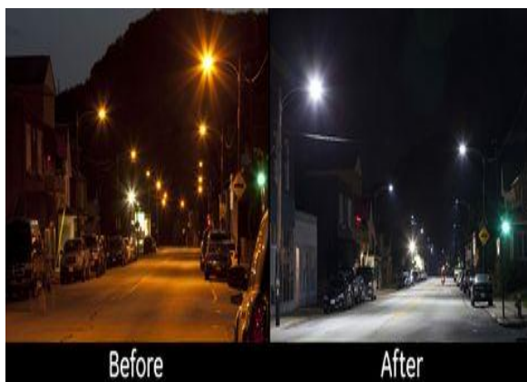
Figure 4 – Today vs Future

Lifi is in its developmental stage , and can still achieve greater levels and speeds clubbed with availability and more reliability along with enhanced security measures . Development in the Near field communication can be made through this. Also we may turn our street lights into potential modern age cellular towers, enhancing network opportunities.